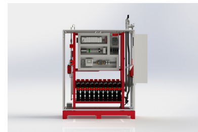
Front view cutaway of Summit 10X ™