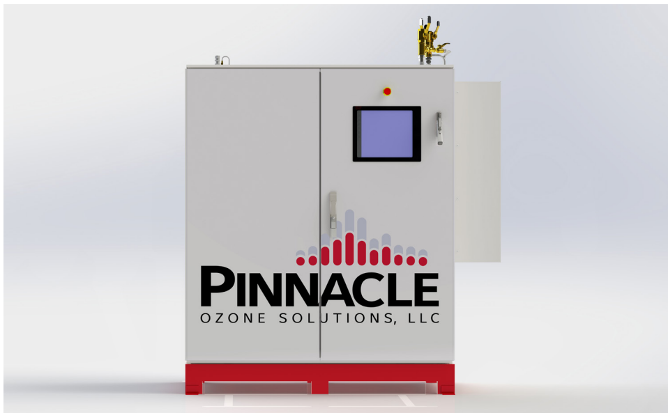
Summit 10X ™ generates up to 166 ppd (75.29 kg/d)

The Summit 10X ™ series ozone generator platform is specifically designed for medium sized installations that need to balance capacity with expandability in a powerful and flexible enclosure. Each Summit 10X ™ platform is configurable up to 166 ppd (75.29 kg/d). All platforms are made in the USA.