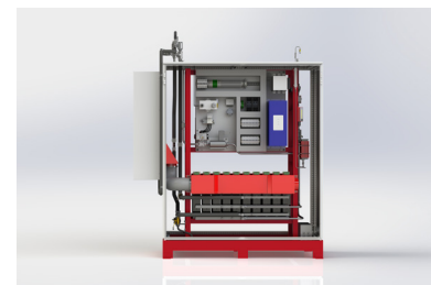
Rear view cutaway of Summit 10X ™