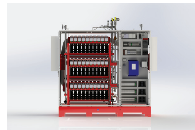
Front view cutaway of Zenith 30X ™