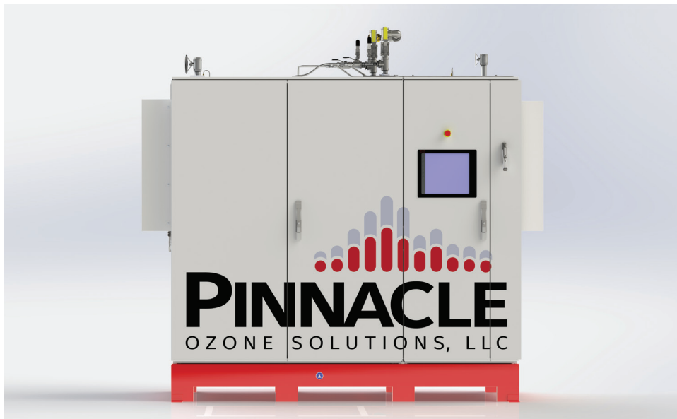
Zenith 30X ™ generates up to 498 ppd (225.89 kg/d)

The Zenith 30X ™ series ozone generator platform is specifically designed for larger installations with mission-critical capacity and redundancy needs. The design features of the Zenith 30X ™ platform can provide up to 99.99% operational readiness, with other standard features. Each Zenith 30X ™ platform is configurable up to 498 ppd (225.89 kg/d). All platforms are made in the USA.